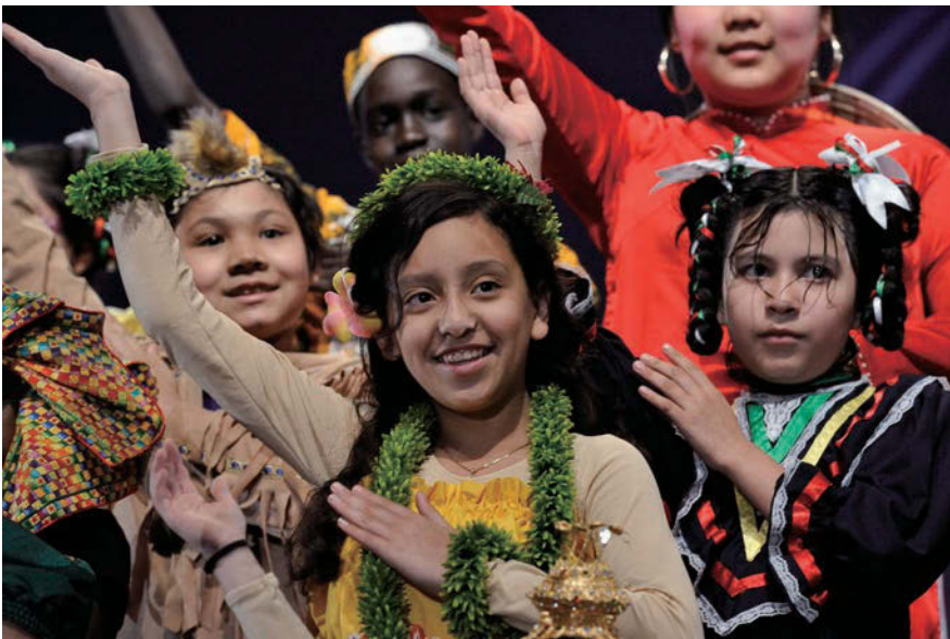
The Della Lamb Children's Choir performs during opening worship of the 2010 United Methodist Women's Assembly in St. Louis, Missouri.