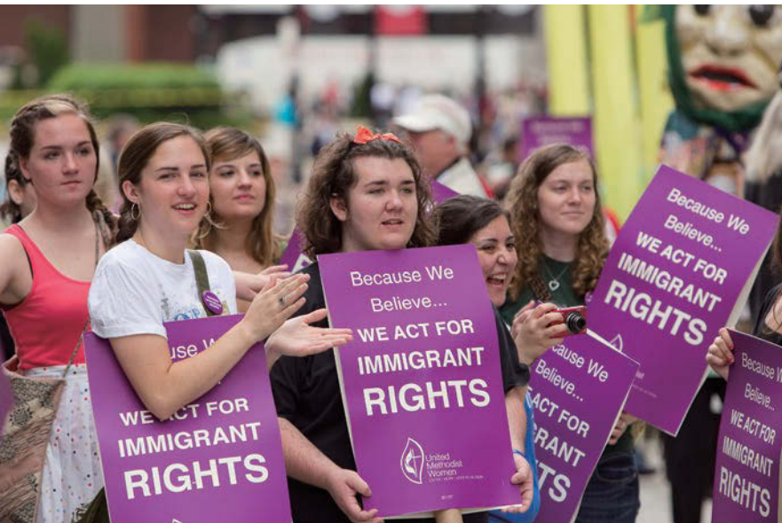
United Methodist Women join a rally in support of immigrants' rights during their Assembly in St. Louis.